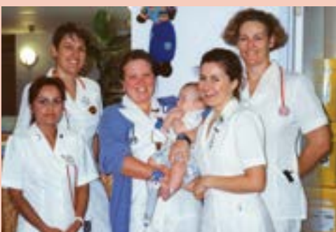
We are so grateful for what your kindness has made possible over the past 30 years. Pictured: Caregivers at St John of God Murdoch Hospital – 1995.