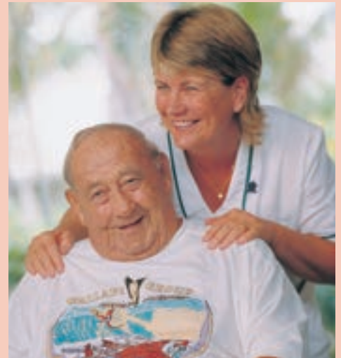
Thanks to your kindness over the past 30 years, caregivers have been able to deliver compassionate care to more patients when they need it most. Pictured: Caregiver and patient - 1999.