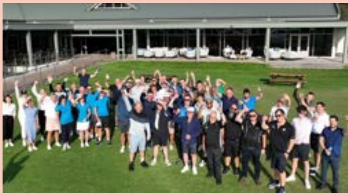
Donors, corporate partners, caregivers and members of the local community at St John of God Geelong Hospital Golf Day fundraiser – 2022.