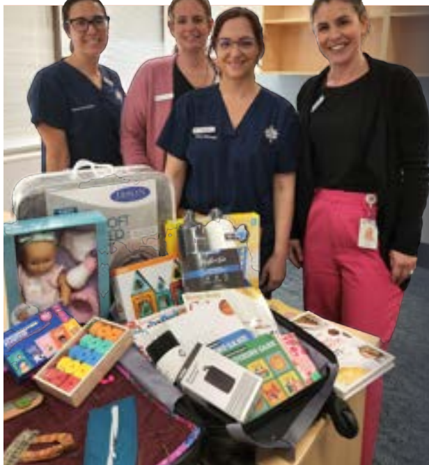
◀ Pictured: St John of God Subiaco Hospital caregivers come together to build special kits for patients