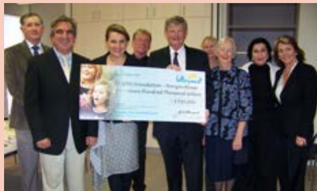
Lotterywest generously supporting St John of God Foundation and Horizon House – 2007.