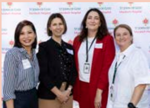
St John of God Foundation and Mission caregivers celebrate the 25th anniversary of St John of God Murdoch Community Hospice – 2023.