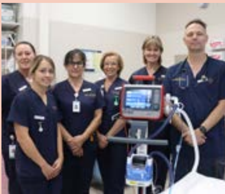
Murdoch ED caregivers welcome the arrival of Hamilton Ventilator thanks to donor support - 2021.