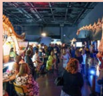
Donors, beneficiaries and caregivers come together for An Evening to Celebrate Philanthropy, amongst the dinosaurs at WA Museum Boola Bardip – 2022.