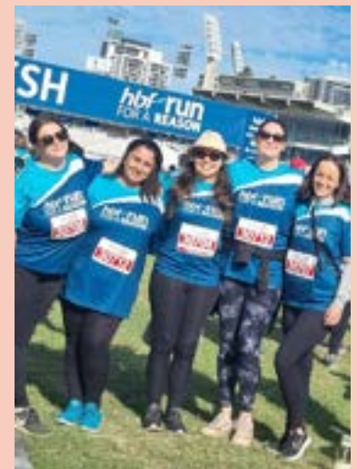
Caregivers celebrate at the finish line for HBF Run for a Reason - 2023.