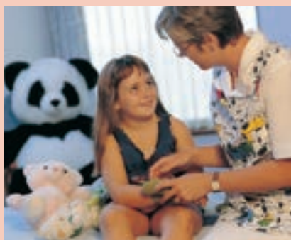
Community donations through St John of God Foundation have been bringing hope to our hospitals since 1994. Pictured: Caregiver and young patient – 1999.