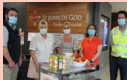
Kindness Cart for caregiver wellbeing, generously funded by Kane Constructions at St John of God Geelong Hospital – 2022.