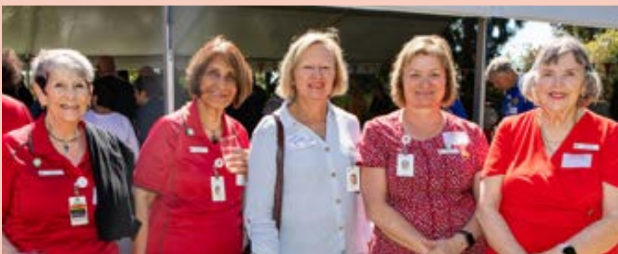
Re-opening of Murdoch Community Hospice - 2021.