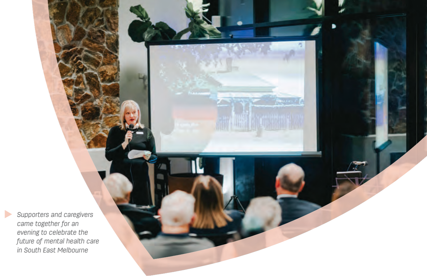
Supporters and caregivers came together for an evening to celebrate the future of mental health care in South East Melbourne