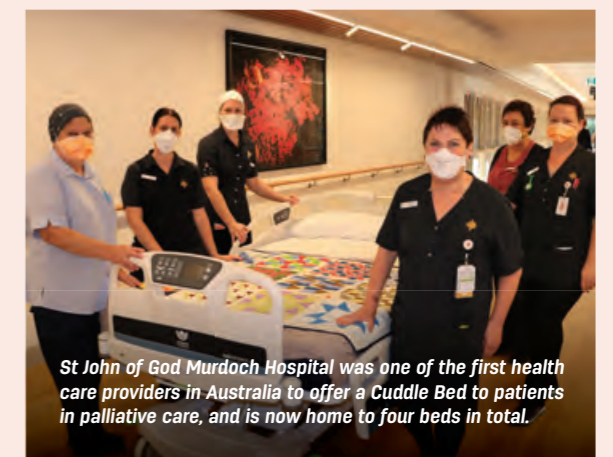
St John of God Murdoch Hospital was one of the first health care providers in Australia to offer a Cuddle Bed to patients in palliative care, and is now home to four beds in total.

We are so grateful to our donors for their generous support of Cuddle Beds at St John of God Health Care.