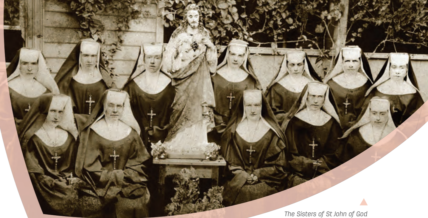
▲ The Sisters of St John of God (pictured circa 1897) have been dedicated to helping the sick and needy for over 150 years.