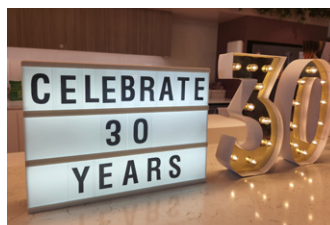
30th birthday decorations at our Perth office