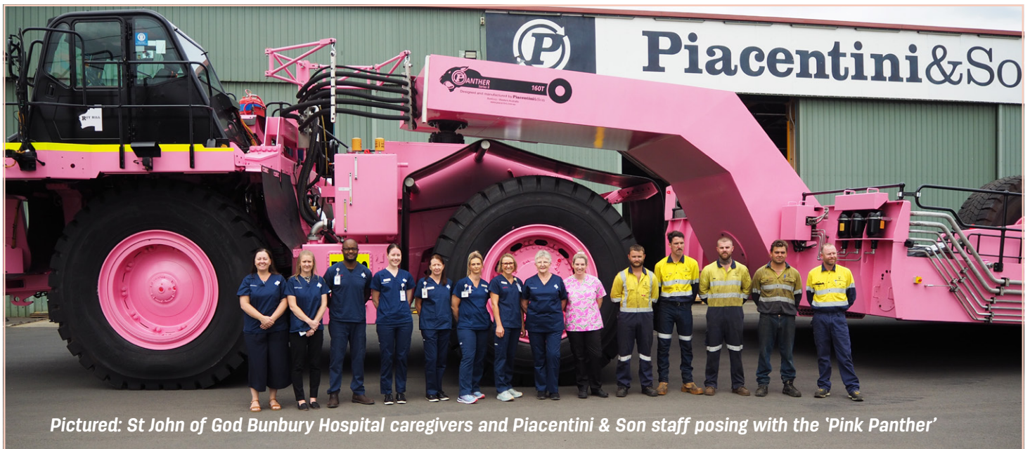
Pictured: St John of God Bunbury Hospital caregivers and Piacentini & Son staff posing with the 'Pink Panther'