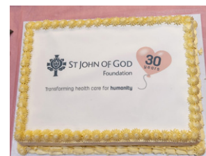
Our 'birthday cake'!