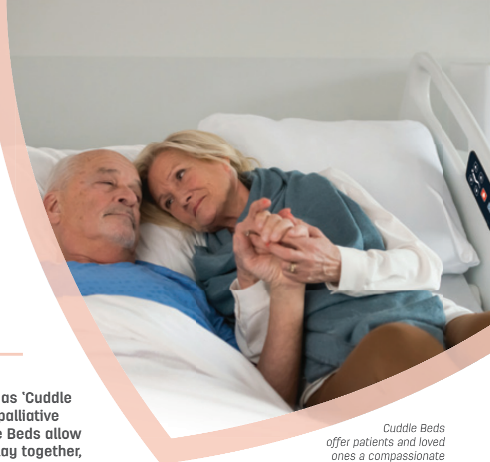
Cuddle Beds offer patients and loved ones a compassionate approach to end-of-life care.

Together with your support, the Foundation aims to fund additional Cuddle Beds to offer more palliative patients at Murdoch Hospital this meaningful approach to care.