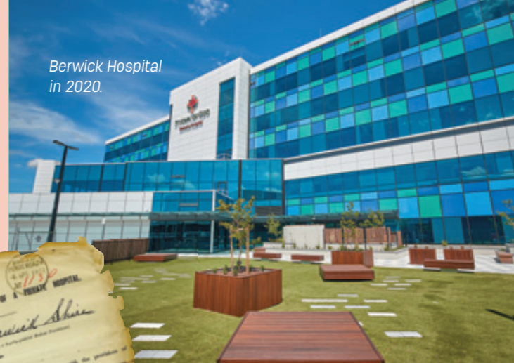
Berwick Hospital in 2020.