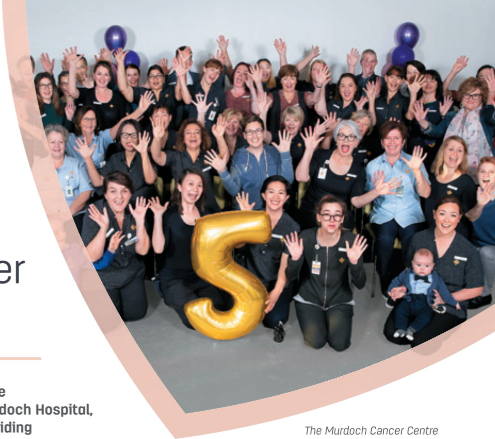
The Murdoch Cancer Centre team on their 5th anniversary.

If you're interested in community fundraising, please visit www.sjogfoundation.org.au/fundraise or contact us on 1800 281 288.