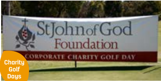
Charity Golf Days