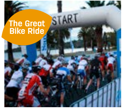
The Great Bike Ride