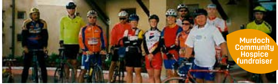
Murdoch Community Hospice fundraiser