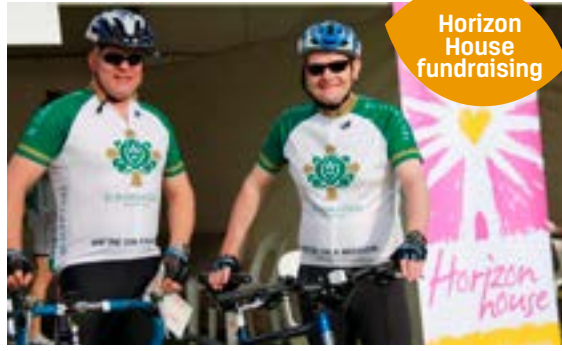
Horizon House fundraising