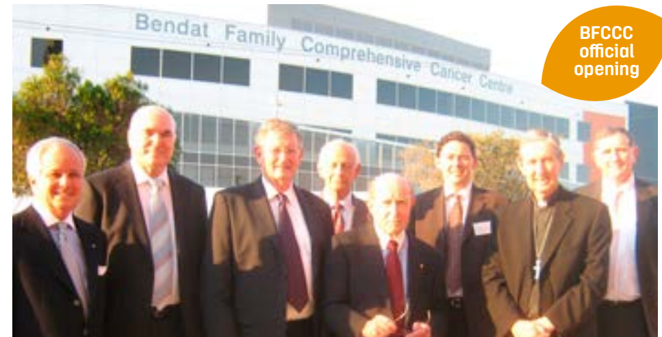
BFCCC official opening