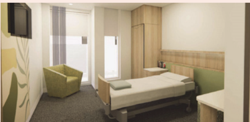
▲ Artist's impression of a patient room at the new St John of God Langmore Centre.